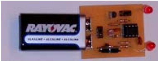
(Battery not included)

Here is a nice little board that uses a PIC microcontroller to control a pair of LED “eyes”. There are 2 modes of operation – a dim-on and dim-off mode with controllable rate and a realistic random blink. The eyes go off when a sensor on the main board is illuminated.